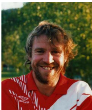
Shepherd “Stunning strike”