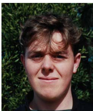
Wisby “Crucial save”